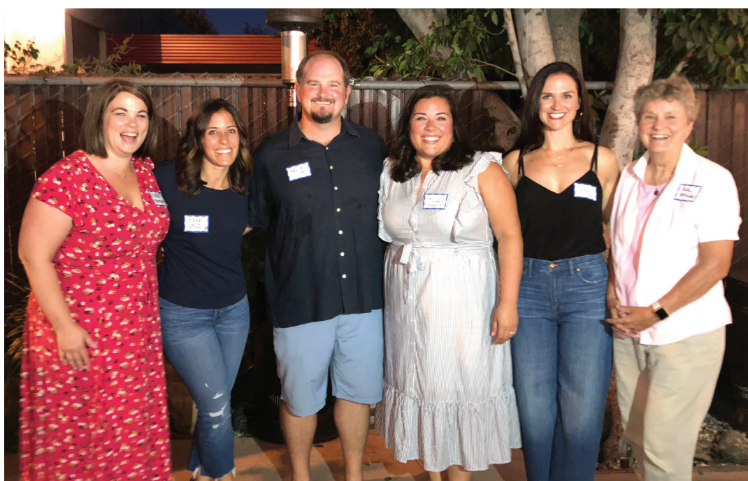
HFS Alumni Council Members at the first Holy Family School Alumni Mixer at Mijares Restaurant, September 2018.