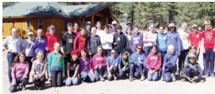
6th Grade Science Camp