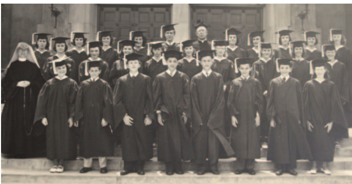
Holy Family School Graduates in 1950

Due to a shortage within the religious community, the sisters of Loretto withdrew from Holy Family Parish in August of 1980. A lay principal and an all layperson faculty began work in the fall of 1980. Since that time, the school has continued with an all layperson staff.