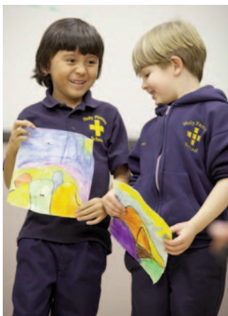
Meet the Masters Art Program