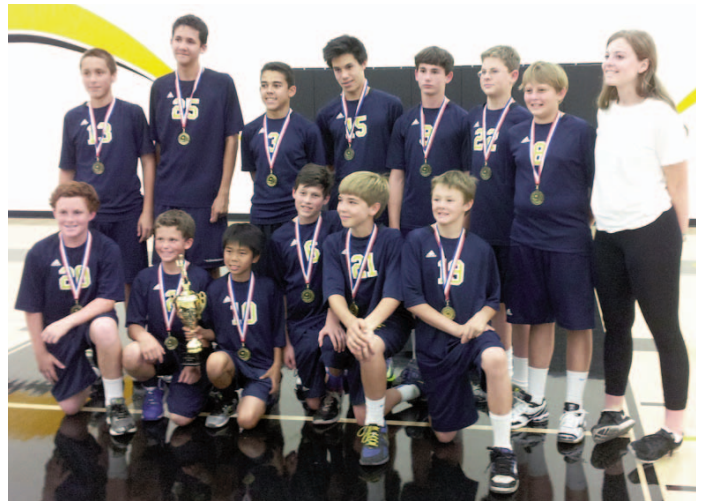
Boys Volleyball – 2nd Place in CYO Championship Game

On average, tuition increases 3%-4% per year.