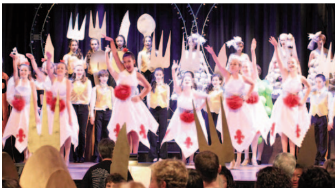
Drama Performance of Beauty and the Beast

Young actors and crew members in grades 5-8 make the Holy Family stage come alive every spring. Auditions begin in January and rehearsals start soon after. Past performances have included: Guys and Dolls , Charlie and the Chocolate Factory , Sound of Music , Cinderella , Thoroughly Modern Millie , and Beauty and the Beast . Our 3rd and 4th graders are the stars for the December play. Last year they wowed us with Yes Virginia, There is a Santa Claus ; this year we're bringing a Charlie Brown Christmas to the stage. Through our drama program, students build confidence, learn to work as a team, and find their creative side.