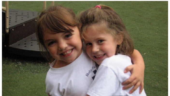
Time Well Spent

As a GAINS program volunteer tutor for the last 11 years, I have personally witnessed the increased confidence and resulting remarkable academic improvements achieved by the children who participate in this incredible program.