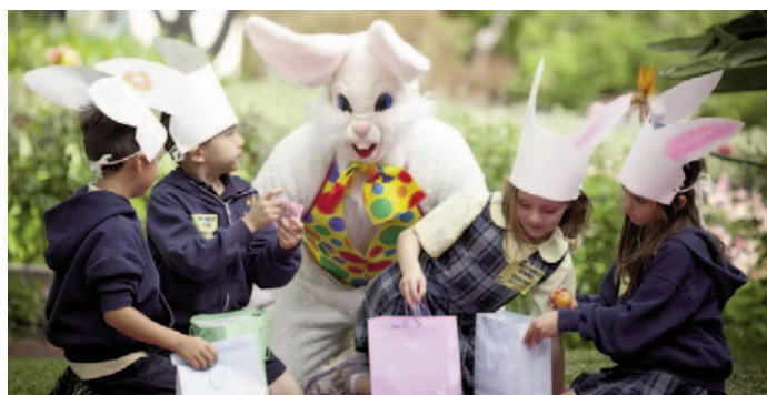
Kindergarten Easter Celebration

Please submit a recent photograph of your family for our file when you come for your screening appointment.