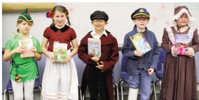
3rd Grade Literature Tea