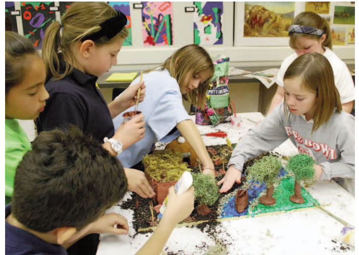
3rd Grade Indian Village Project