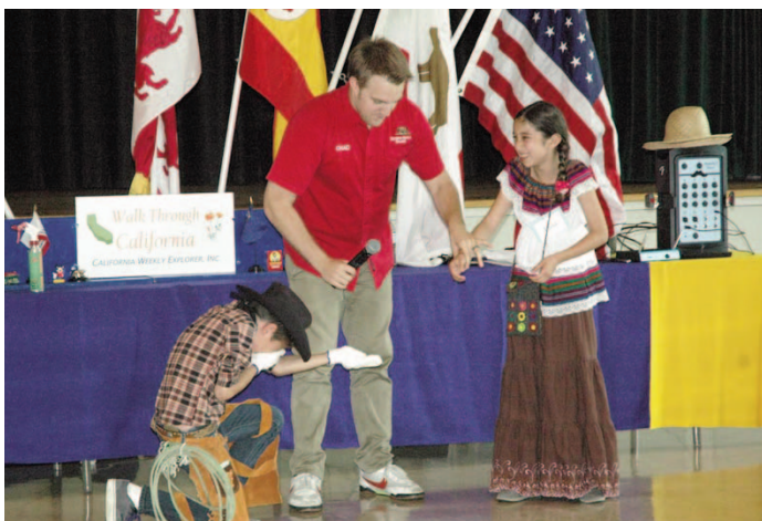
4th Grade Walk Through California

Holy Family School will host a school-wide Open House during Catholic School's Week on Thursday, January 30, 2014 from 7:00-8:30 p.m. We strongly encourage all prospective parents and children to attend this event, meet faculty members, tour the facility and preview our curriculum. This will be a wonderful opportunity for prospective families to become acquainted with Holy Family School.