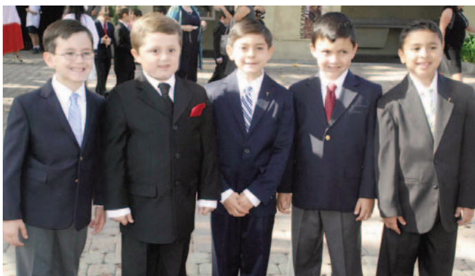
First Holy Communion

The mission of Holy Family School is to instill Christian values and Catholic principles in students through the Gospel message of Jesus. We foster and nurture the development of the whole child and strive to achieve educational excellence. We are guided in faith and principle by our Schoolwide Learning Expectations, and we work toward enabling our students to grow and be successful in attaining them.