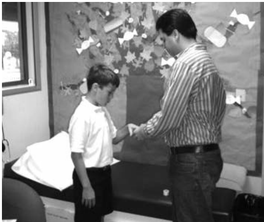
Legacy of Learning supports our school nurse.

In order for us to maintain the level of education we have come to expect, we need Parent Guild fundraisers, such as Innisbrook, Jog-a-thon and Scrip to help bridge the tuition gap